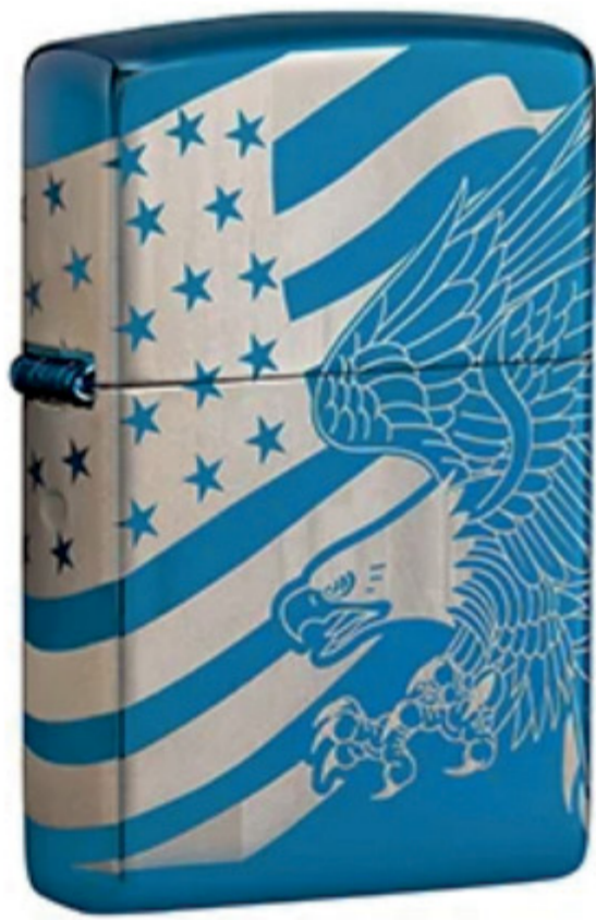
360° Laser Engrave

Using computer programming, Zippo's newest process 360° laser engraving, seamlessly circumnavigates a lighter entire surface. Bringing laser engraving process to a new level.