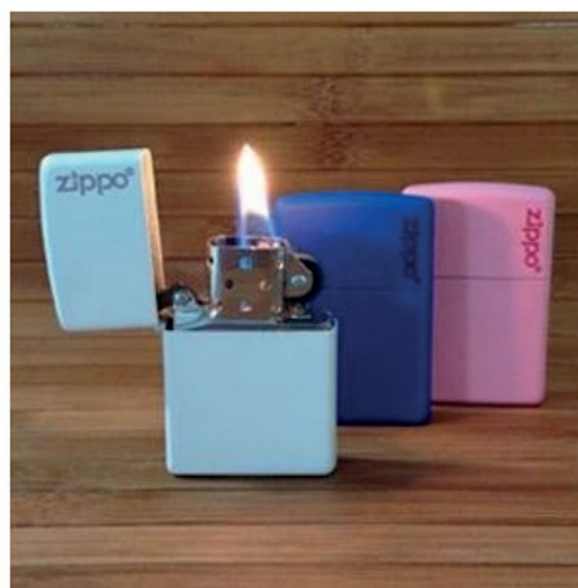
Why we love them