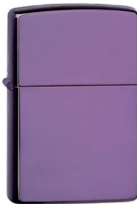
High Polish Purple

Classic chrome plated lighter is bonded with a micro-thin, scratch resistant coating to create a shimmering rainbow.