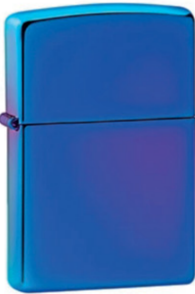
High Polish Indigo

Introducing High Polish Indigo, a cool-toned, color-shifting, finish that shimmers with metallic fuchsias, deep purples, and blues. A classic chrome-plated lighter is bonded with a micro-thin, scratch resistant coating to achieve this look.