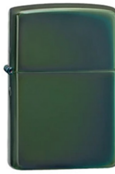
High Polish Green

Classic chrome-plated lighter is bonded with a micro-thin, scratch resistant coating to achieve Zippo's luminous, intense black, mirror-like finish.