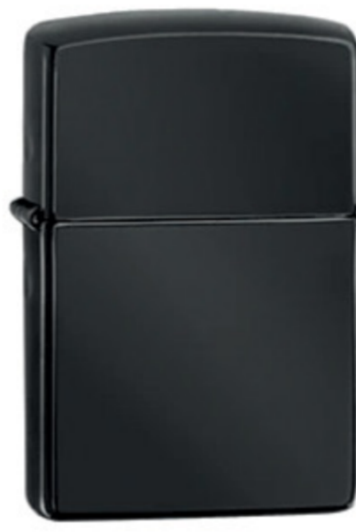
High Polish Black

Introducing High Polish Indigo, a cool-toned, color-shifting, finish that shimmers with metallic fuchsias, deep purples, and blues. A classic chrome-plated lighter is bonded with a micro-thin, scratch resistant coating to achieve this look.