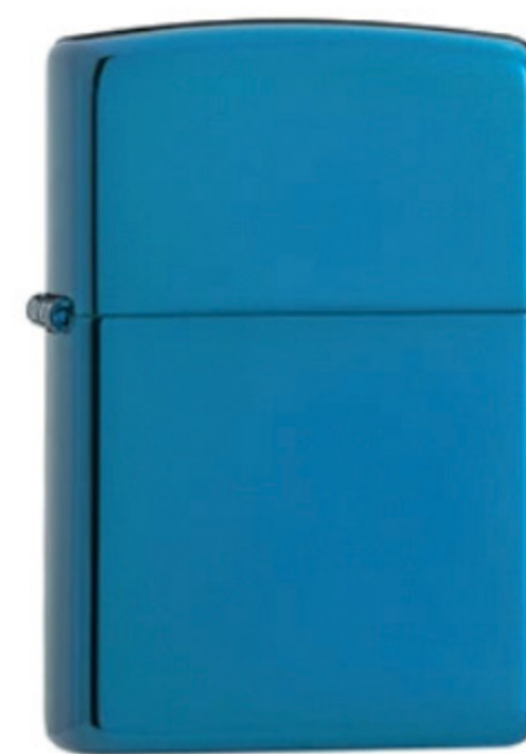
High Polish Blue

A colorful translucent coating is applied to the lighter to produce a sheer, glossy finish.