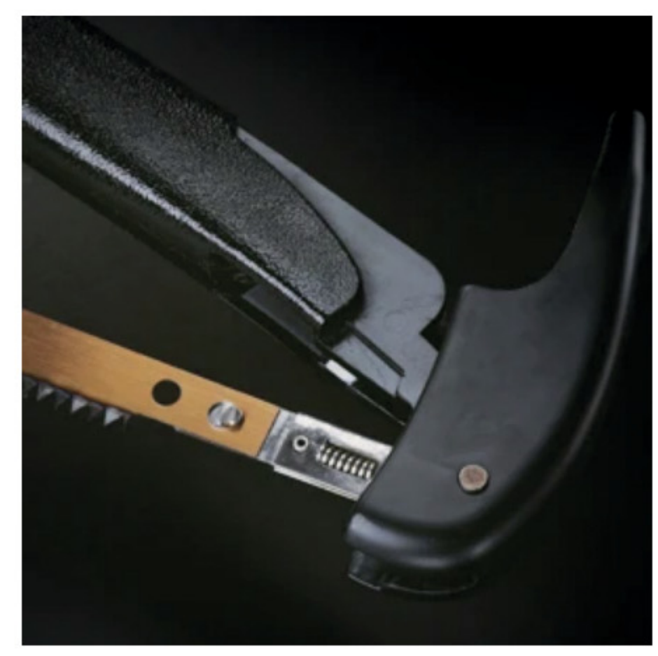
Snap Down Cam

Self-adjusting tension compensator keeps saw blade tight while sawing wood.