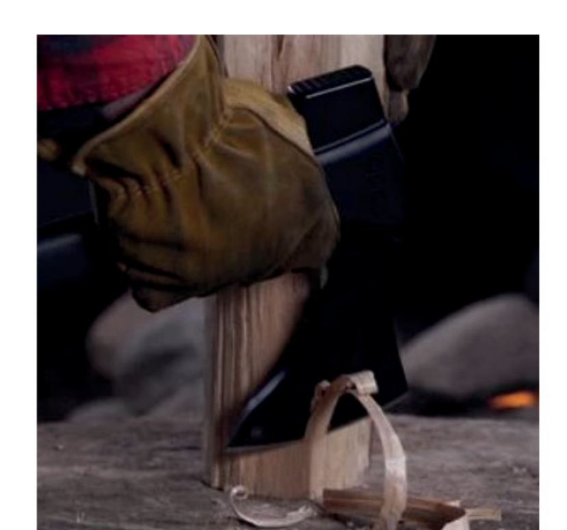
It shaves tinder

Chop small to medium fire wood with the 5 inch steel hatchet head.