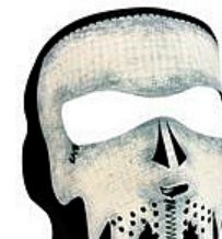
Full Face Mask

Glow in the dark product contain phosphor. Phosphor is a substance that radiates light after being energized with a light source. After energized, the phosphor then slowly releases their stored energy over time and glows. Make a fun and bold statement that glows into the night.