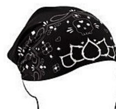
Headwrap, Highway Honey

Developed through a process of heating and use of nanotechnology, bamboo charcoal fabric is created from dried bamboo that is burned in high temperatures until it is reduced to charcoal. The bamboo charcoal is then refined into nano-sized particles then infused with different fabrics. Bamboo fabric is much softer than cotton and has natural anti-microbial agents that inhibit the growth of odor causing bacteria. Bamboo is highly absorbent, it absorbs moisture four times faster than cotton. With its anti-bacterial qualities and 50+ UPF protection, bamboo is well suited for performance wear.