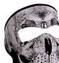
Full Face Mask

Reflective fabric is material with added reflective tape or ink. Rays of light bounces off the reflective material back to its source, which allows for the wearer of the reflective fabric to be seen. Reflective print is perfect for anyone looking for high-visibility in low-light conditions when illuminated by light.