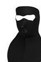
Full Mask w/ Neck Shield