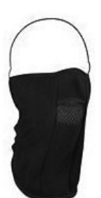
Face Mask w/ Mesh Mouth