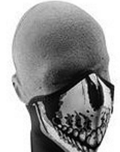
Neo-X Face Mask

The bamboo charcoal in this hypoallergenic biodegradable filter naturally creates an antibacterial barrier that provides protection against dust and other airborne particles.