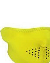
Half Face Mask