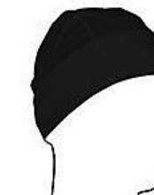
Skull Cap, MicroLUX™