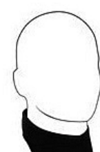
Airsoft Neck Protector