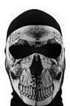
COOLMAX Skull Cap