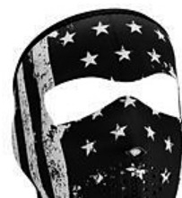
Full Face Mask

Neoprene is a soft, flexible, and durable synthetic material. Neoprene is water resistant, weather resistant and is known for resisting degradation from all types of elements. It also provides thermal and moisture insulation making it perfect for every season.