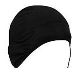
COOLMAX Skull Cap®