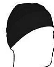
MicroLUX® Skull Cap