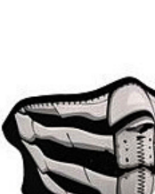
Half Face Mask