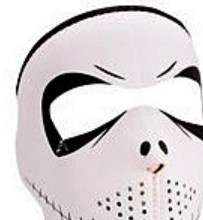
Full Face Mask

Reversible items provide two items in one allowing an alternative option.