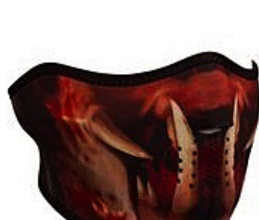
Half Face Mask