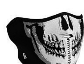
Half Face Mask