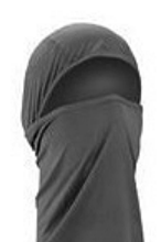
MicroLUX® Convertible Balaclava®

MicroLUX® offers soft stretchy comfort that has anti-bacterial treatment that inhibits the growth of odor causing bacteria. The MicroLUX® fabric wicks away moisture from the skin, keeping you cool and dry; making it perfect for every season. Ties in the back for a secure, customized fit. One size fits most. Great for under helmet use. MicroLUX® also provides 50+ UPF protection. Material: 88% Micropoly, 12% Spandex knit (include MicroLUX® diagram)