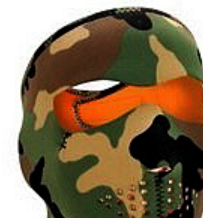
Full Face Mask

High visibility headwear greatly improves the visibility of people in the workplace or outdoor activist. Bright colors increase visibility especially during poor lighting or gloomy weather conditions.