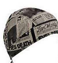
Road Hog Flydanna