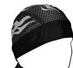
Vented Sport Flydanna