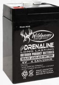
6V TAB-STYLE BATTERY