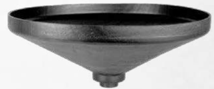
POLY FUNNEL FOR 55 GAL DRUM