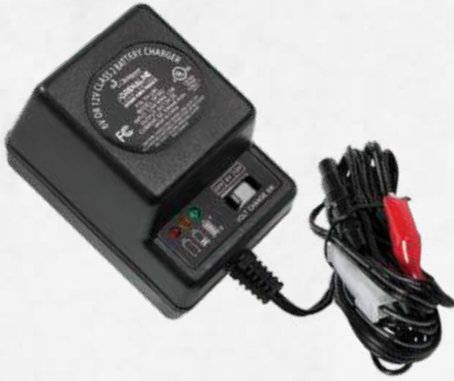
6V/12V BATTERY CHARGER