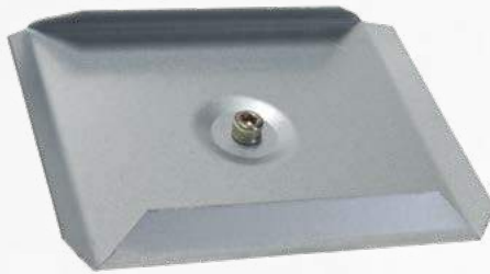
12V SPINNER PLATE