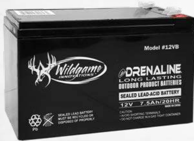
12V TAB-STYLE BATTERY