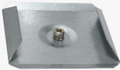
6V SPINNER PLATE