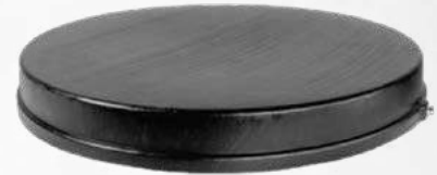
POLY LID FOR 55 GAL DRUM