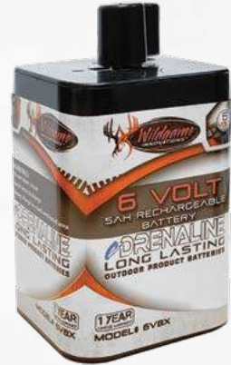
6V SPRING TOP BATTERY