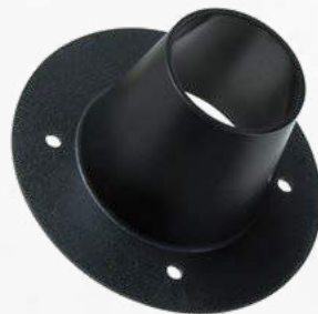
2" DROP FUNNEL