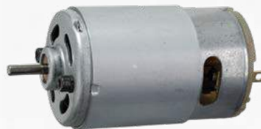
6V REPLACEMENT MOTOR