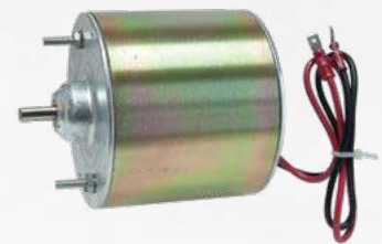
12V REPLACEMENT MOTOR