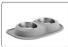
Double Low Feeding System