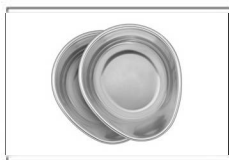
Additional Stainless Steel Bowl Set