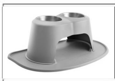
Double High Feeding System