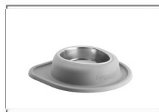
Single Low Feeding System