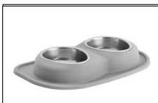
Double Low Feeding System