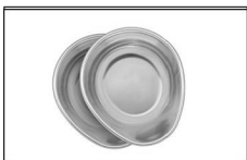
Additional Stainless Steel Bowl Set