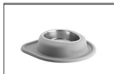
Single Low Feeding System