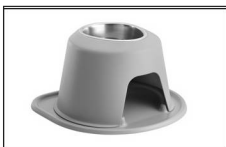
Single High Feeding System