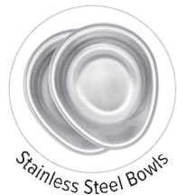
Stainless Steel Bowls

Learn more about pet shop on our website.