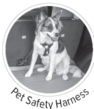
Pet Safety Harness

Enhance your pet's life with additional pet products on WeatherTech