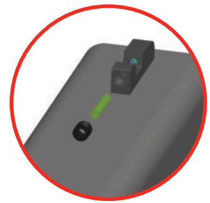
Removable retainer ring allows access to user-replaceable fiber