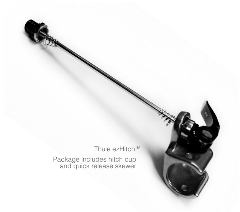
Thule ezHitch™ Package includes hitch cup and quick release skewer