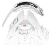
SOFT INSTEP 4

--SIDI's TECHNO-3 PUSH dials in fit along the entire length of the shoe, adapting the upper to the shape of the foot for a customized fit. SIDI's famously reliable and replaceable closures are improved by an all new proprietary SIDI Wire material that is completely non-binding for intuitive and effortless on-the-fly adjustments. Like most SIDI small parts, the TECHNO-3 PUSH buckle is serviceable and replaceable. It can be adjusted while riding, thanks to an innovative button which can be pushed to lift the buckle and facilitate the adjustment.