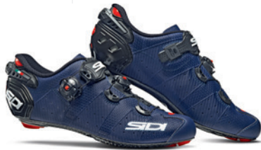
MATT BLUE / BLACK

-- The VENT CARBON Sole features a light and replaceable heelpad in polyurethane to improve walkability and a replaceable integrated toe pad/vent cover. The key benefits of the VENT CARBON Sole are not only superior power transfer, because of its light weight and stiffness, but also warm weather comfort. The VENT CARBON Sole is designed with an integrated vent and air channels for heat dissipation and air flow. The vent can be opened or closed for 4-season comfort. The VENT CARBON Sole is handmade exclusively of carbon fiber in a weave pattern oriented at opposing angles that maximize stiffness while allowing for a small degree of controlled flex in the toe area. This carefully designed flex biomechanically relieves stress on the plantar tendon and helps promote circulation. The VENT CARBON Sole features a standard 3-hole drilling pattern, printed 10 mm lateral and fore/aft cleat alignment scale as well as the Look Memory Eyelet for easy cleat alignment and replacement. For triathlon, the vent also serves as a water drain, dramatically improving foot comfort after a wet transition.