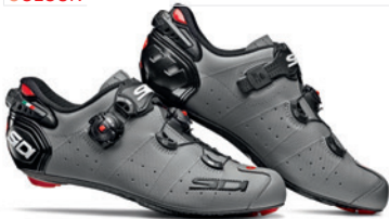
MATT GREY | BLACK