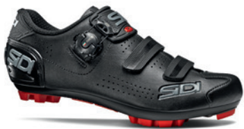
BLACK | BLACK