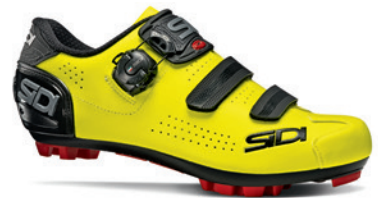
YELLOW FLUO | BLACK