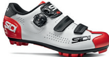
WHITE | BLACK | RED