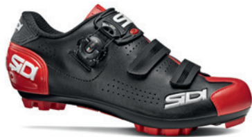
BLACK | RED