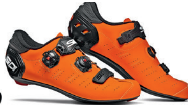
MATT ORANGE / BLACK