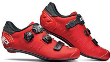
MATT RED | BLACK