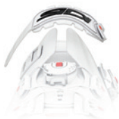
SOFT INSTEP 4

-- The SOFT INSTEP CLOSURE SYSTEM is a wide, anatomically curved strap combined with a soft, thermo-formed EVA pad that distributes pressure evenly over the instep area. The SOFT INSTEP CLOSURE SYSTEM is adjustable from both sides, to perfectly center the EVA pad over a high or low instep. The system eliminates the need for the High Instep Extender. The SOFT INSTEP CLOSURE SYSTEM is replaceable.