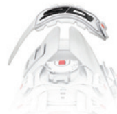
SOFT INSTEP 4

.. The SOFT INSTEP CLOSURE SYSTEM is a wide, anatomically curved strap combined with a soft, thermo-formed EVA pad that distributes pressure evenly over the instep area. The SOFT INSTEP CLOSURE SYSTEM is adjustable from both sides, to perfectly center the EVA pad over a high or low instep. The system eliminates the need for the High Instep Extender. The SOFT INSTEP CLOSURE SYSTEM is replaceable.