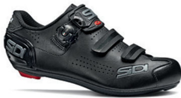
BLACK | BLACK