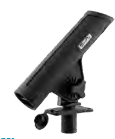
351 Rodmaster II with 244 Flush Deck mount.