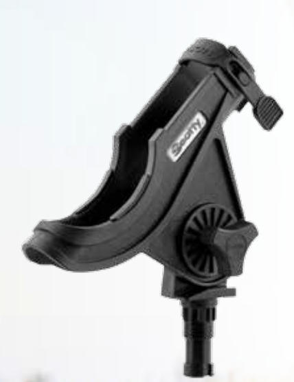
279 Bait Caster/Spinning without mount.

284 Bait Caster/Spinning with 243 Square Rail mount.