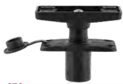
270 Swivel Fishfinder Mount with 244 flush deck mount.

This mount is fully twistable, turnable, rotatable and best of all, instantly portable. Locks down a sport or standard camera without needing a special adapter.