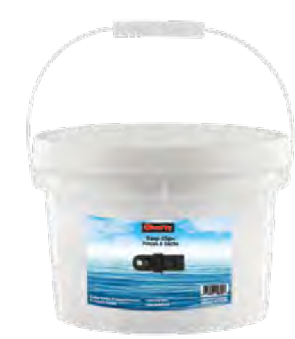
301 Tarp clip Bucket (60)