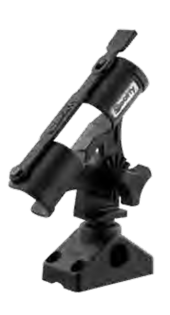
265 Fly rod with 241 Combination side/deck mount.