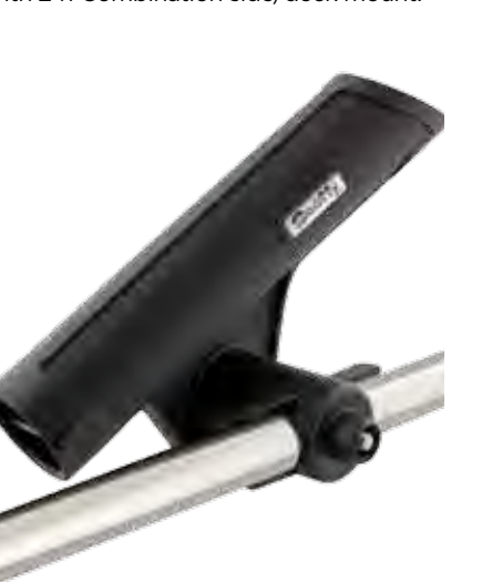
355 Rodmaster II bolts through the boom, fitting 3/4" and 1" Scotty downrigger booms.