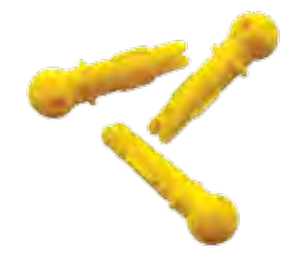
1022 Extra pins for all hairtrigger release clips (3).