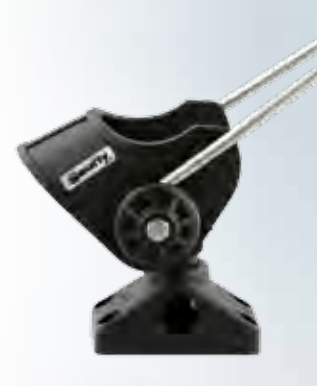
240 Striker with 241 Combination side/deck mount.