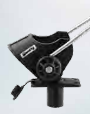
246 Striker with 244 Flush Deck mount.