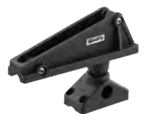
276 Anchor Lock with 241 Combination side/deck mount.