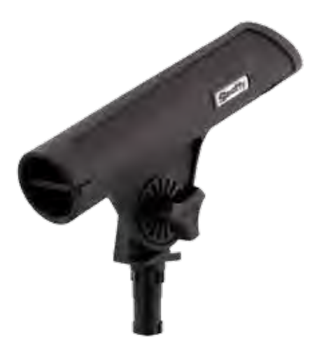
349 Rodmaster II without mount.