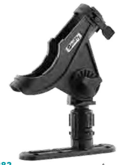
282 Bait Caster/Spinning with 438 Gear-Head and 440-4 Low-Pro Track.