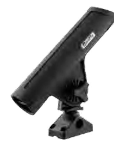
350 Rodmaster II with 241 Combination side/deck mount.