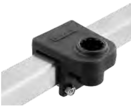
243 1 1/4" Square Rail Mount