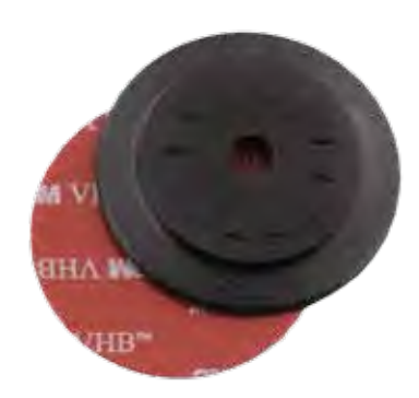
345 2" Stick-On Accessory Mount

Our flexible PVC mounts are the perfect fit where bolts and screws are not an option Simply peel and stick to any ridged surface or glue any of our mounts to your inflatable and you are ready to attach your favourite Scotty product to your watercraft When glue your mount onto a inflatable we always recommend using a marine grade adhesive such as Poly Marine Glue, Stabond UK-148, HH-66 (RH Adhesives), and many more that can be found at your favourite marine dealer