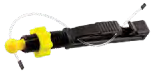
1020 Hairtrigger Release Clip Release clip attaches directly to the downrigger line. Simple and effective.