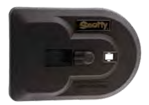
1131 Depthpower Replacement Lid.