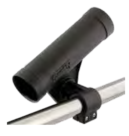
258 Rodmaster clamp-on boom rod holder fits 11/4" Scotty downrigger booms.