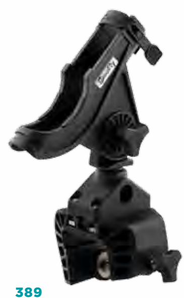
Bait Caster/Spinning with 449 Clamp mount.