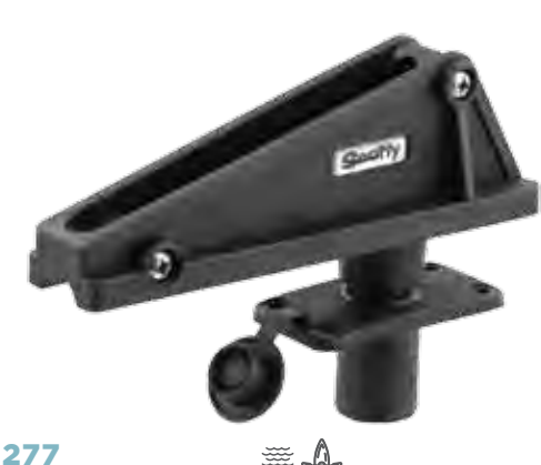
Anchor Lock with 244 Flush Deck mount.