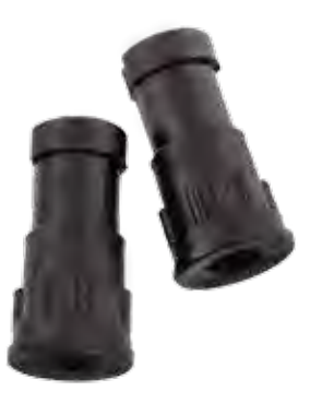
103 Oarlock Post Adapts all Scotty Post-mounts to a 1/2" oarlock socket.