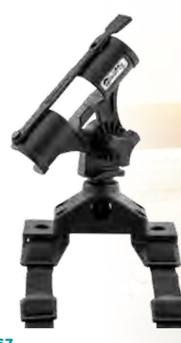
267 Fly Rod with Float Tube mount combination.