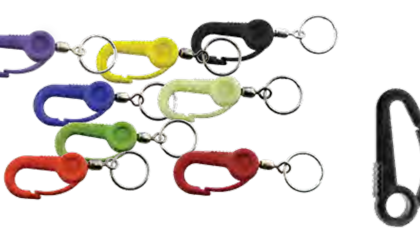
590 Snap Hooks (6)