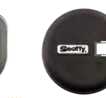
1024 Manual Counter Cover.