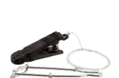
1046 Mini Snapper Release Clip 18" leader with stacking, self-locating snap.