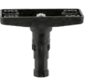
272 Swivel Fishfinder Mount Mount only.

This uses a multi pattern universal top plate and the post mount design for quick removal and adjustable rotation.