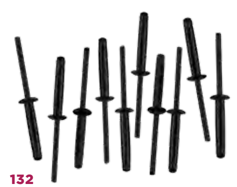
Extra Long Grip Mounting Rivets

These structural rivets are an excellent solution for mounting hardware where you don't have access to the back side of a fastener (10). Great for mounting to thin-walled watercraft.