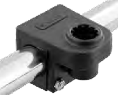
245 1 1/4" Round Rail Mount

These structural rivets are an excellent solution for mounting hardware where you don't have access to the back side of a fastener (10). Great for mounting to thin-walled watercraft.