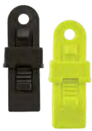
300BK 300YL Tarp Clip (4) Quick and easy to use design with powerful locking jaws for the ultimate hold.