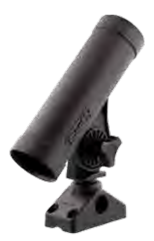
250 Rodmaster with 241 Combination side/deck mount.