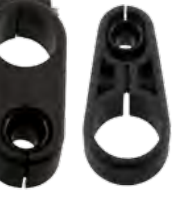
1140 Fairlead for 3/4" downrigger boom. 1141 Fairlead for 1" downrigger boom. 1149 Fairlead for 1 1/4" downrigger boom.