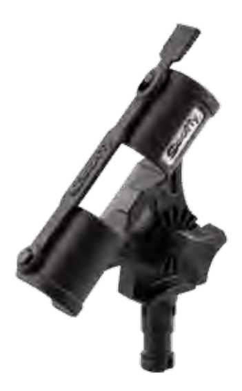
260 Fly rod without mount.

Innovative compact design allows for hands free trolling with a fly rod Rod can be secured in holder with a soft latching strap which snaps over the top Works well with "short butt" fly rods All post mount Scotty Rod Holders are fully adjustable