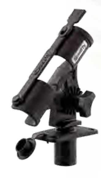
264 Fly rod with 244 Flush Deck mount.