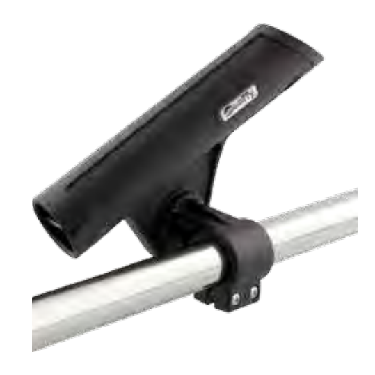
358 Rodmaster II clamp-on boom rod holder fits 11/4" Scotty downrigger booms.