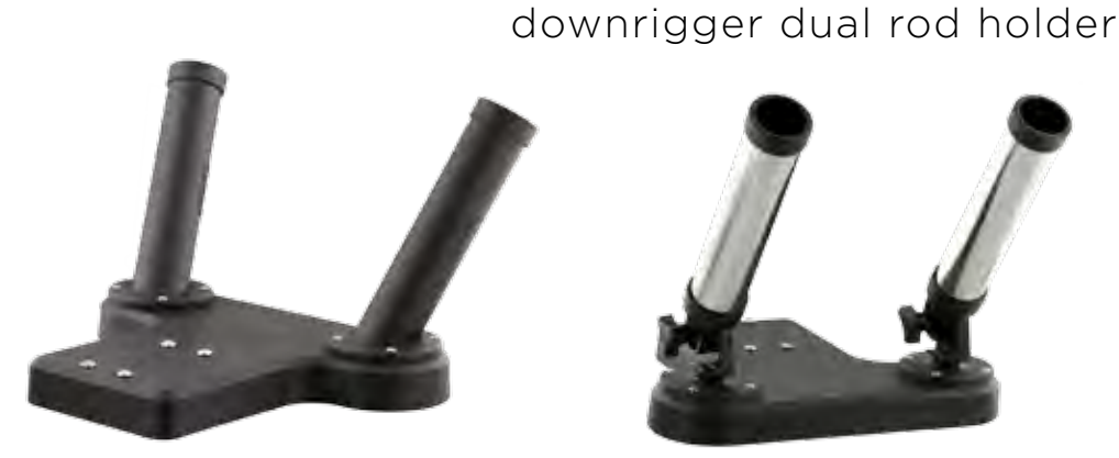
247 Dual Rod Holder Designed for use with the 1026 Swivel mount.