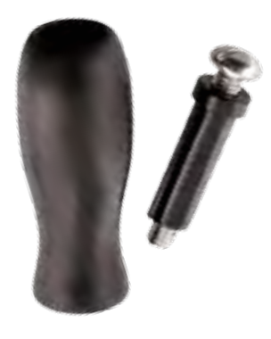
1142 Manual Downrigger Handle.