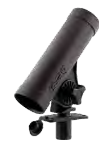
251 Rodmaster with 244 Flush Deck mount.