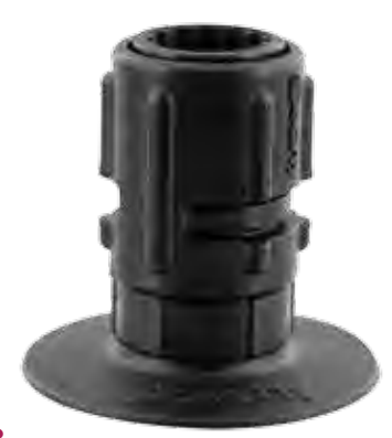
448 3" Stick-On Accessory Mount with Gear-Head