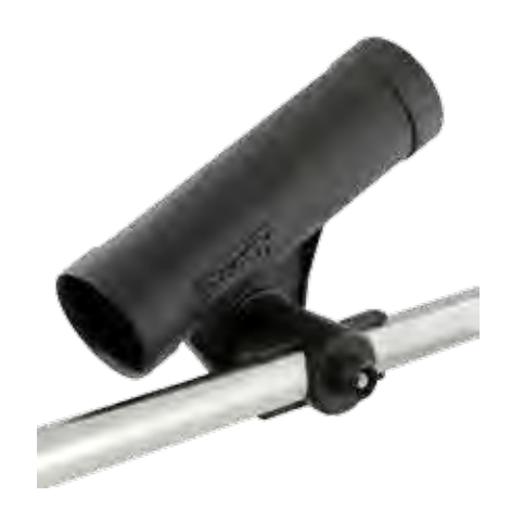
255 Rodmaster bolts through the boom, fitting 3/4" and 1" Scotty downrigger booms.