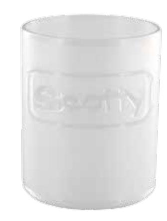
125 Tumbler cup Holds up to 12 oz. dishwasher safe.