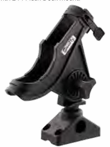
280 A ster/Spinning with 241 Combination side/deck mount.

281 Bait Caster/Spinning with 244 Flush Deck mount.