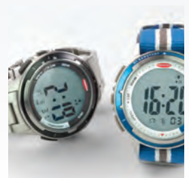
Stylish stainless steel models