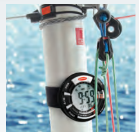
Mast mounting option