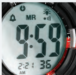
Large quick view displays