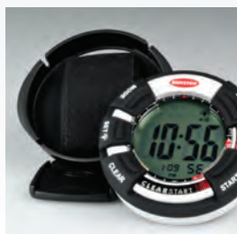
Removable timer unit