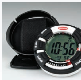
Removable timer unit