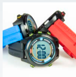
Compact 40mm models