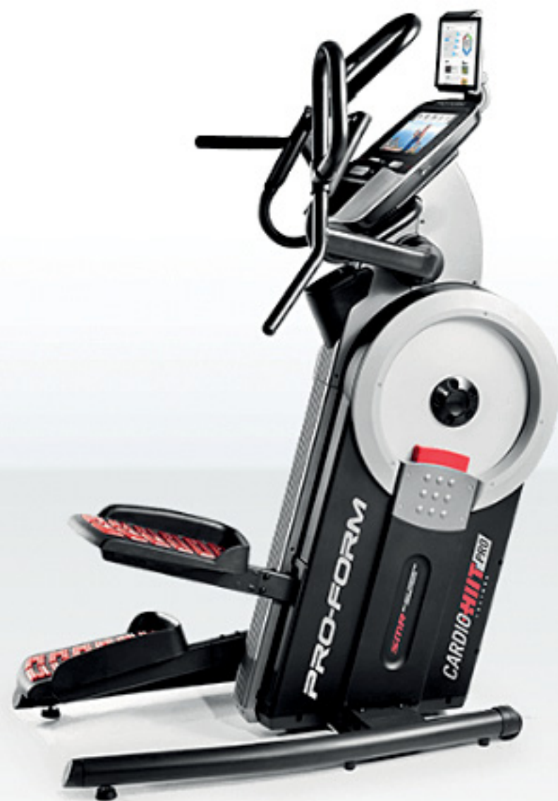
SMART HIIT Trainer Pro