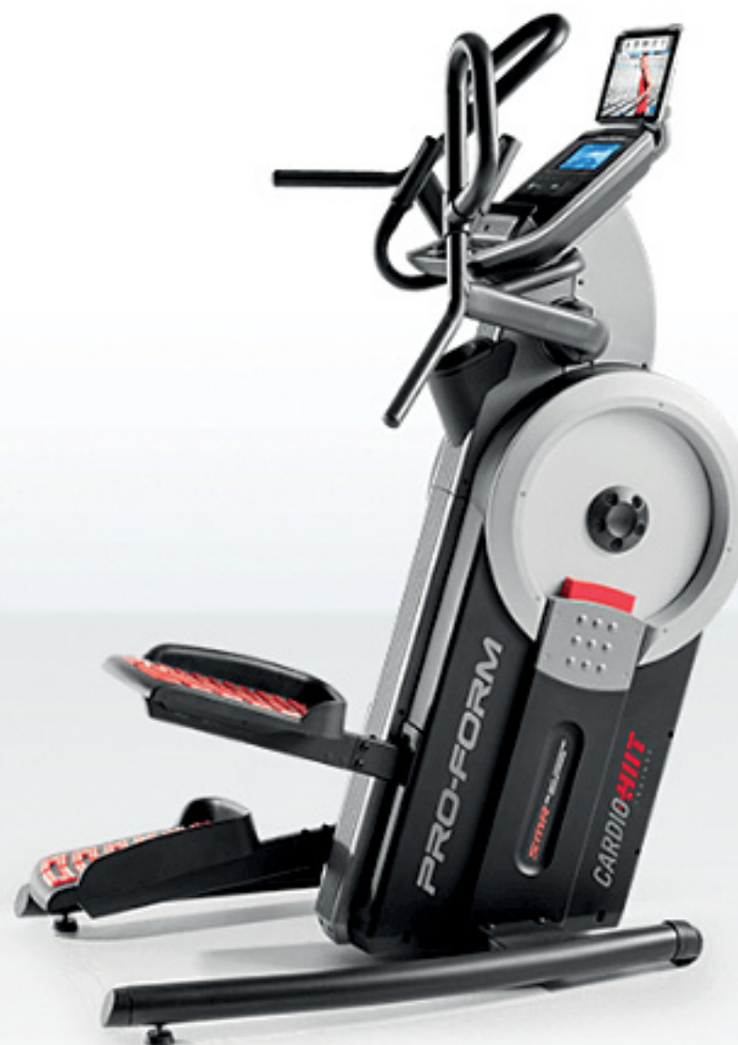
SMART HIIT Trainer