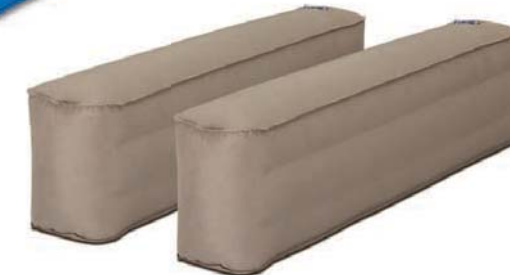
Item No. PPI-PROAC5

AirBedz Wheel Well Inserts convert all your AirBedz mattresses into a regular air mattress for use in tents or as a guest bed in the home.