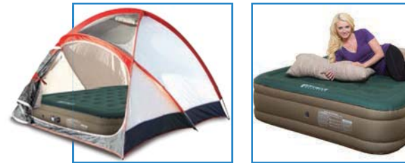
Perfect for Camping!