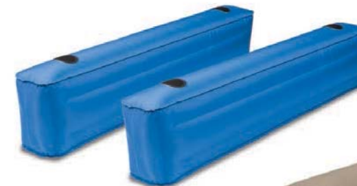
Item No. PPI-AC5