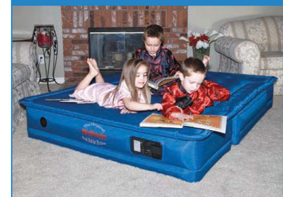
Shown with Optional Wheel Well Inserts

AirBedz Wheel Well Inserts convert all your AirBedz mattresses into a regular air mattress for use in tents or as a guest bed in the home.