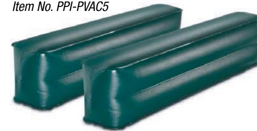
Item No. PPI-PVAC5