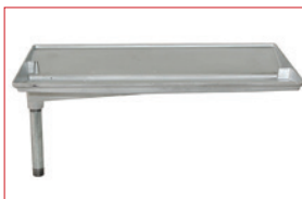
Cast Aluminum Drip Tray Shields food from direct contact with flame reducing flare-ups and providing consistent heat