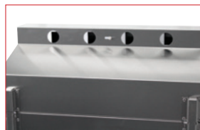
Vents with Damper Slide For added heat retention in cold and/or windy weather