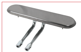
Stainless Steel Dual Burner Provides precise heat and infinite settings