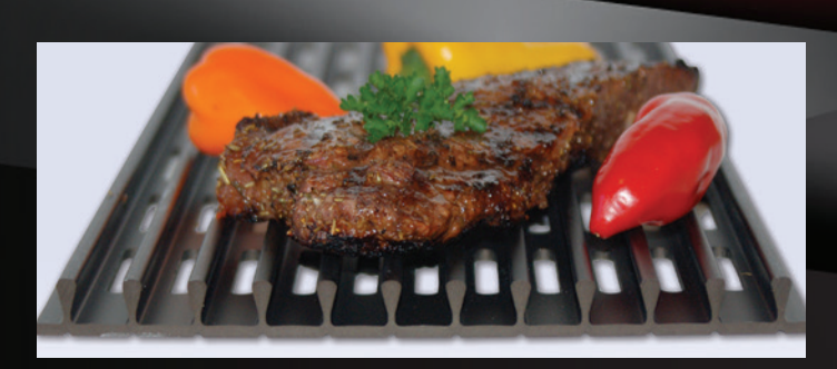
Ribbed Side ▲