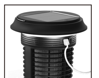
Micro USB charging port

Self-cleaning brush rotates around every 72 hours.