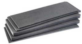
V730FS 5 pc. Replacement Foam Set