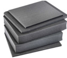
V600FS 5 pc. Replacement Foam Set