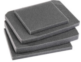
V100FS 4 pc. Replacement Foam Set