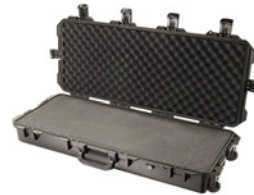
iM3100-X0001 With Foam