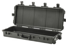
iM3100-X0000 No Foam