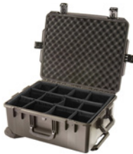
iM2720-X0002 With Padded Dividers