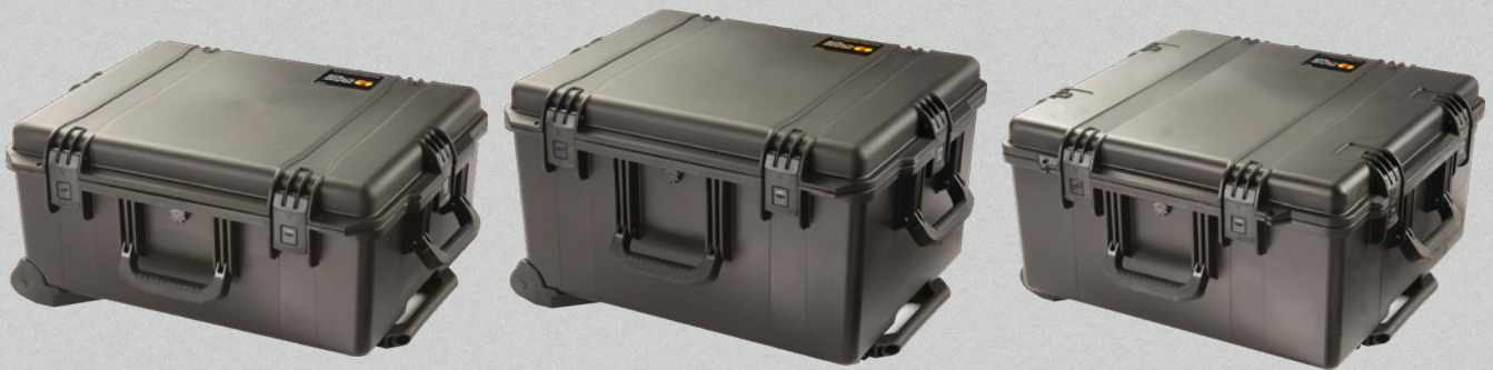
Pelican Storm iM2720 Case

The iM2720, iM2750 and iM2875 Pelican Storm Transport Cases now feature a two stage pull handle.