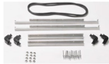
iM27XX-BEZEL-LID Lid Bezel Kit