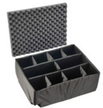
iM2720-DIV Padded Divider Set