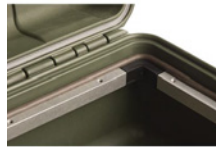
iM27XX-BEZEL Base Bezel Kit