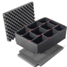
iM2720TPKIT TrekPak Case Divider Kit