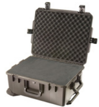
iM2720-X0001 With Foam