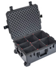
iM2720-X0006 With TrekPak Divider System