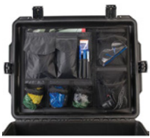
iM27XX-UTILITYORG Utility Organizer