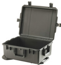
iM2720-X0000 No Foam