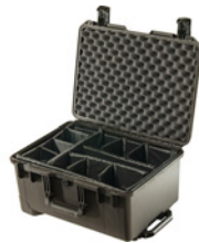
iM2620-X0002 With Padded Dividers