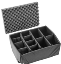
iM2620-DIV Padded Divider Set