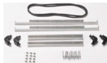
iM26XX-BEZEL-LID Lid Bezel Kit