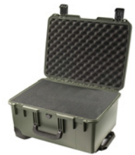
iM2620-X0001 With Foam