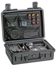
iM26XX-PHOTO PALLET Photography Pallet