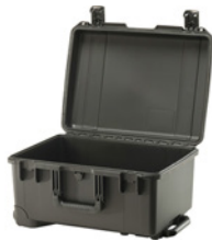
iM2620-X0000 No Foam