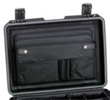
iM26XX-LIDORG Lid Organizer