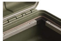
iM26XX-BEZEL Base Bezel Kit