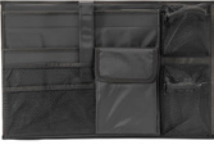
iM26XX-UTILITYORG Utility Organizer