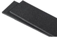
IM2620TPDIV Extra TrekPak Dividers