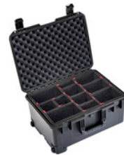
iM2620-X0006 With TrekPak Divider System