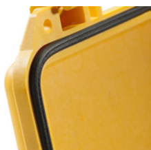
1753 Replacement O-ring