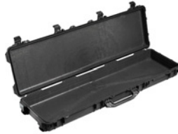
1750NF No Foam