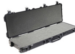
1750WF With Foam