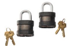
PL2 Padlock (2 pack)