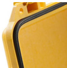
1703 Replacement O-ring