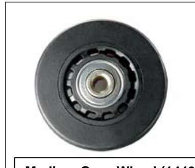
Medium Case Wheel (1440 – 1560)

Nylon hubs (which connect the polyurethane wheel to the ball bearings) were chosen for their extreme heat and impact resistance.