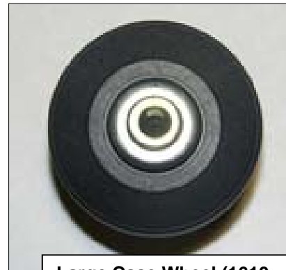
Large Case Wheel (1610 – 1780)