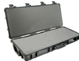
1700WF With Foam