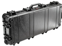
1700NF No Foam