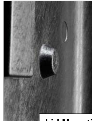
Lid Mounting Boss