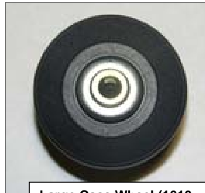
Large Case Wheel (1610 – 1780)