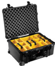
1564 With Padded Dividers