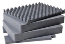
1561 4 pc. Replacement Foam Set