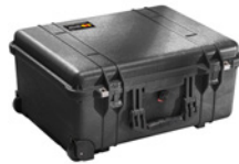
1560NF No Foam