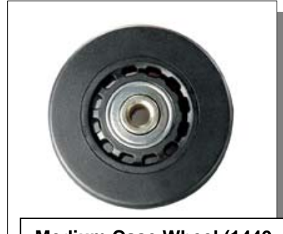
Medium Case Wheel (1440 – 1560)

Nylon hubs (which connect the polyurethane wheel to the ball bearings) were chosen for their extreme heat and impact resistance.