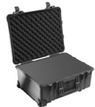
1560WF With Foam