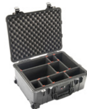
1560TP With TrekPak Divider System