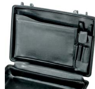
Brief Case Lid Organizer