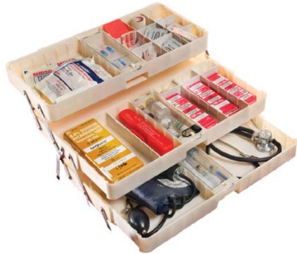
1460 EMS Case Tray Set

Please contact your sales representative for pricing and availability.