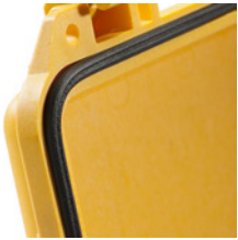
1463 Replacement O-ring