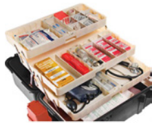
1466 Tray System for 1460EMS