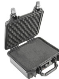
1200WF With Foam