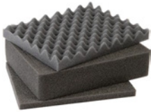
1201 3 pc. Replacement Foam Set