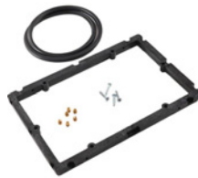
1200PF Special Application Panel Frame