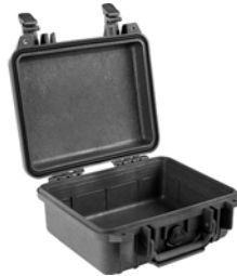
1200NF No Foam