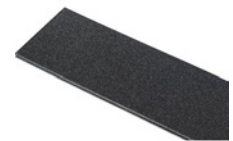
1120TPDIV Extra TrekPak Dividers