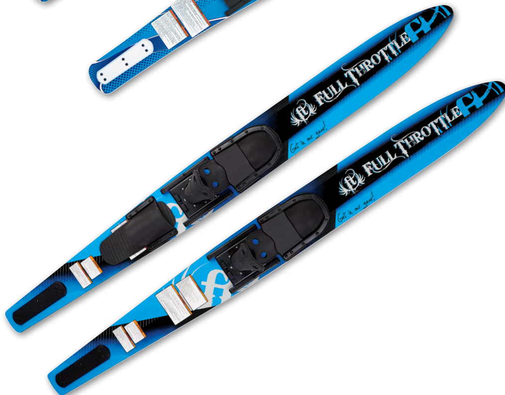
TRADITIONAL COMBO SKIS UNIVERSAL 330500-500-999-12