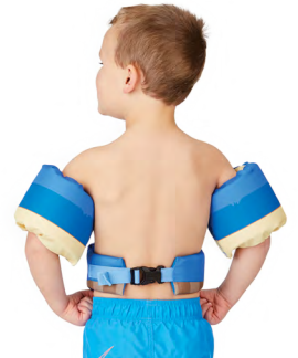
Adjustable buckle snaps in back