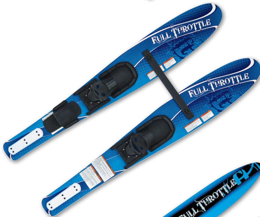
SHAPED JUNIOR SKIS UNIVERSAL 330100-500-999-16