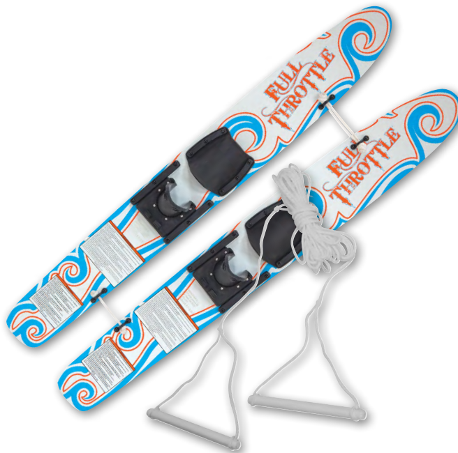
TRAINER SKIS UNIVERSAL 330000-702-999-16