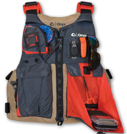
Shown fully loaded. Kayak fishing essentials not included.