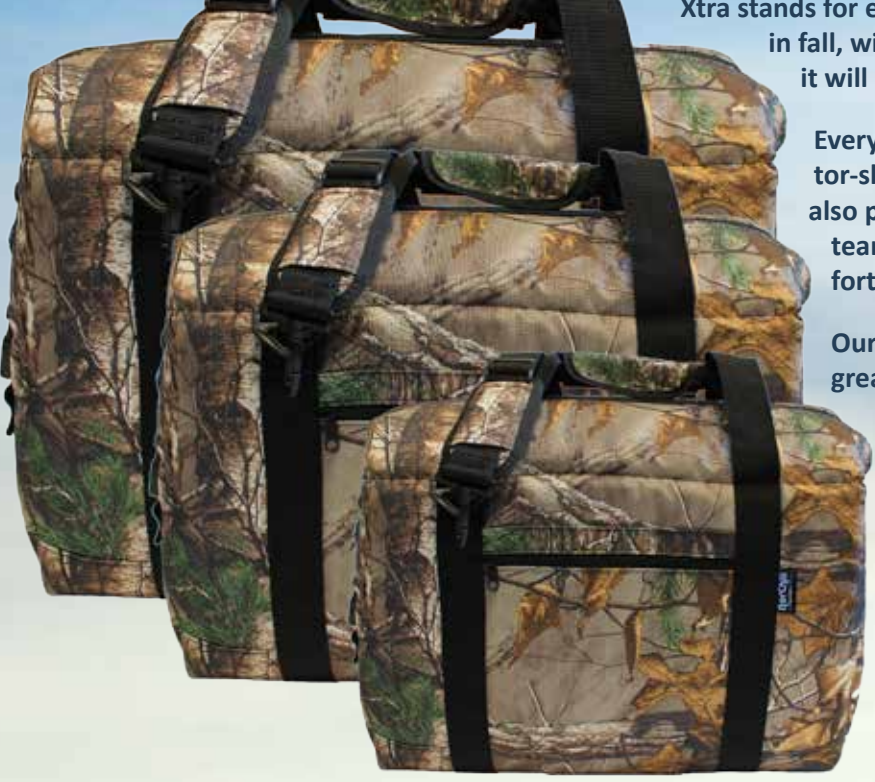
Available in Small, Medium and Large

All Outdoorsman Series Coolers also incorporate a roll-up design. When you get to your destination, just load in your food and drinks, ice it up and you're ready to tackle any adventure. Simply roll them up to minimize space while traveling.