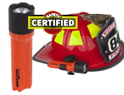
200L XPP-5418RX (Light only) XPP-5418RX-K01 (Light with mount) AVAILABLE IN