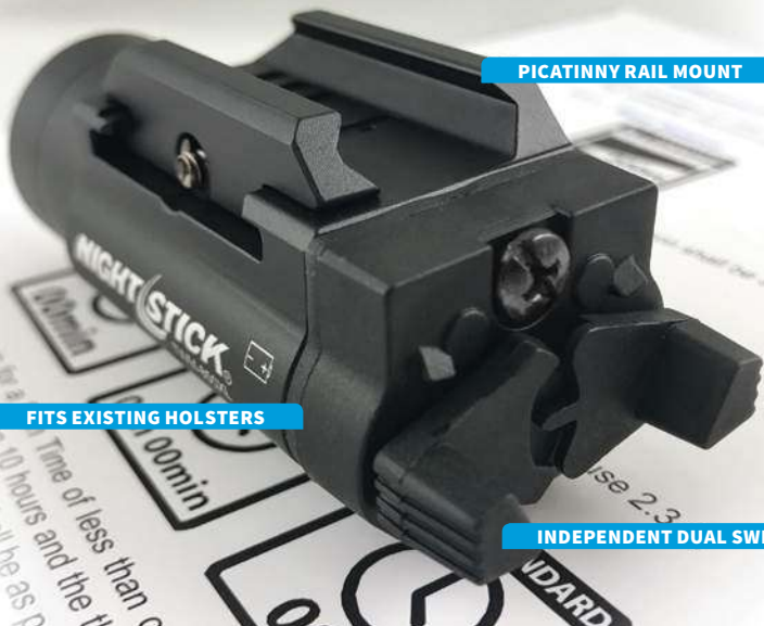
PICATINNY RAIL MOUNT