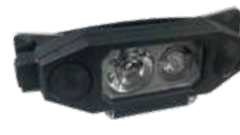
450L Dual-Light™ NSP-4616B