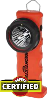
Dual-Light™ 200L XPP-5570RA AVAILABLE IN