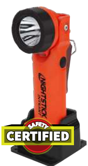
INTRANT™ Dual-Light™ 205L XPR-5568RX AVAILABLE IN