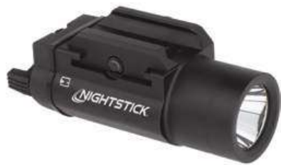
Strobe 350L TWM-350S 850L TWM-850XLS