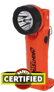
INTRANT™ Dual-Light™ 205L XPP-5566RX AVAILABLE IN