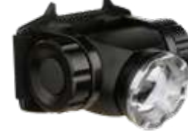
1,000L USB, Strobe USB-4708B