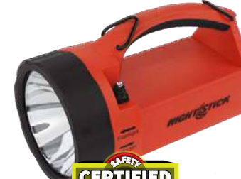
1100L VIRIBUS™ XPR-5581RX AVAILABLE IN