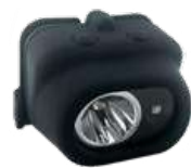
180L Dual-Light™ NSP-4608B