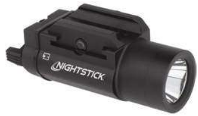
350L TWM-350 850L TWM-850XL