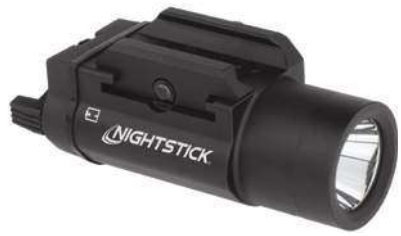
350L TWM-350 850L TWM-850XL