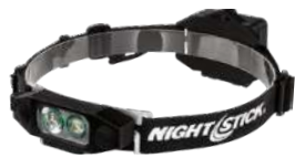
Dual-Light™ 450L NSP-4616B