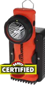
Dual-Light™ 200L XPR-5572RA AVAILABLE IN