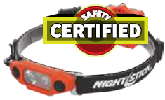
DICATA™ Dual-Light™ 310L XPP-5462RX AVAILABLE IN