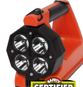
1750L INTEGRITAS™ XPR-5582RX AVAILABLE IN