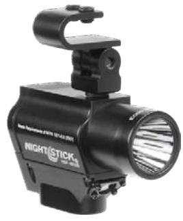
Dual-Light™ 220L NSP-4650B