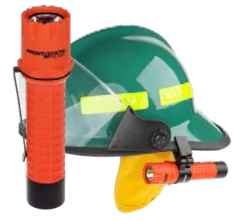
180L FDL-300R (Light only) FDL-300R-K01 (Light with mount)