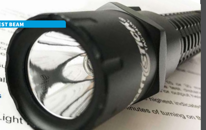
CREE TrueWhite® TECHNOLOGY FOR THE CLEAREST BEAM