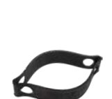
NS-HSR1 (Strap only)