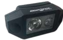
300L Dual-Light™ NSP-4614B