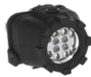
35L Dual-Light™ NSP-4602B