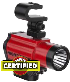
FORTEM™ Dual-Light™ 250L XPP-5466R AVAILABLE IN