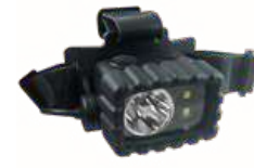
175L Dual-Light™ NSP-4612B