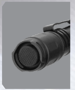
Large textured tail-switch