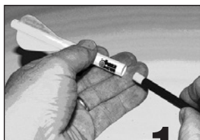
Slide onto arrow 1