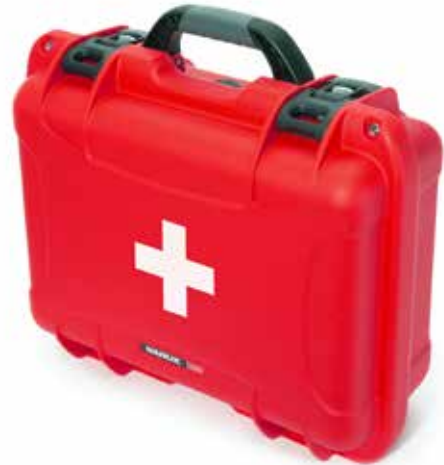
920 First Aid Cases

Exterior dimensions L15.4" × W12.1" × H6.8" L391mm × W307mm × H173mm