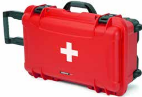
935 First Aid Cases

Interior dimensions L20.5" × W11.3" × H7.5" L521mm × W287mm × H191mm