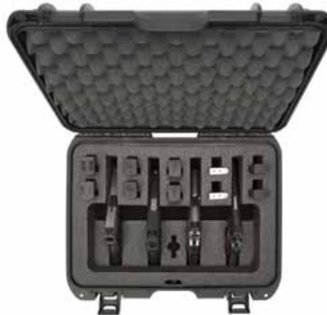
925 4UP Revolver

Exterior dimensions L16.9" × W12.9" × H9.3" L429mm × W328mm × H236mm