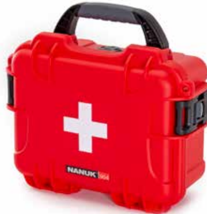
904 First Aid Cases

Exterior dimensions L9.1" × W6.8" × H3.8" L231mm × W173mm × H97mm