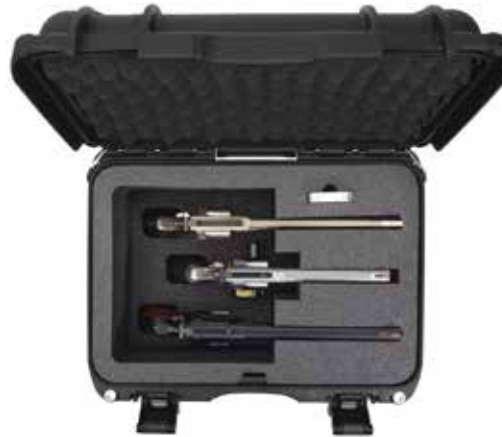
918 3UP Revolver