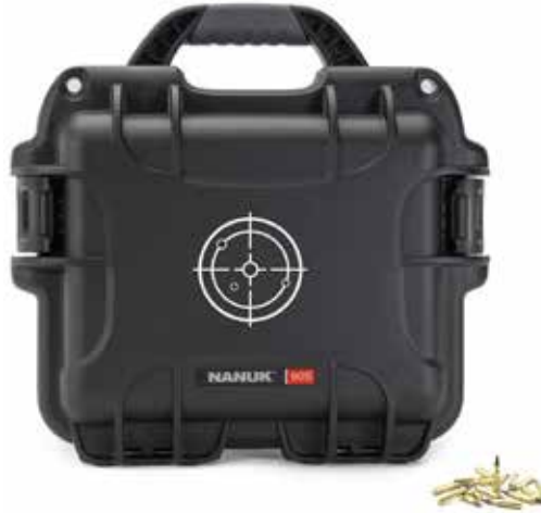
905 Waterproof Ammo Case