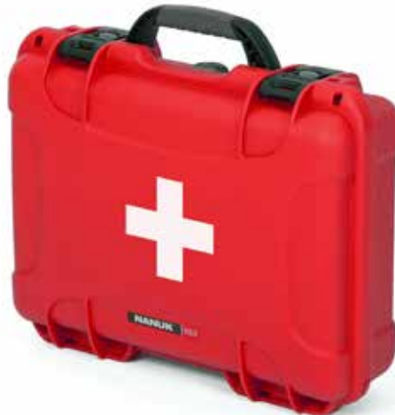
910 First Aid Cases

Exterior dimensions L12.6" × W9.0" × H4.4" L321mm × W229mm × H111mm