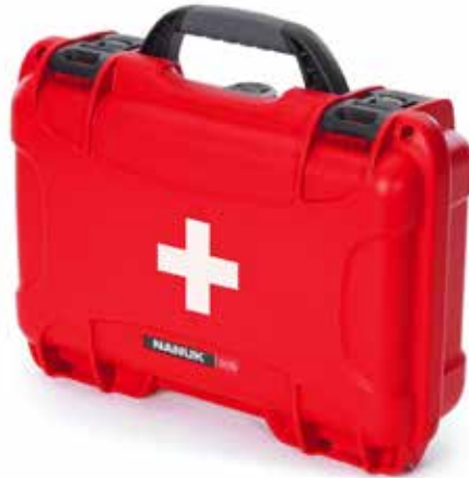
909 First Aid Cases

Interior dimensions L11.4" × W7.0" × H3.7" L291mm × W178mm × H93mm