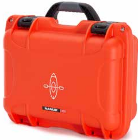
915 Kayak Case

Exterior dimensions L22.0" × W14.0" × H9.0" L559mm × W356mm × H229mm