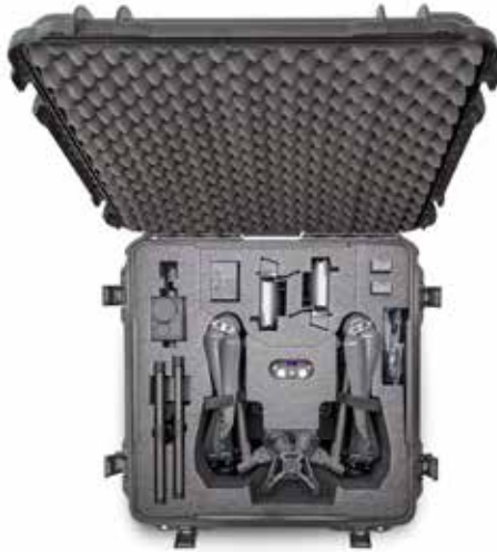
970 For DJI™ Matrice M300 RTK

Interior dimensions L24.0" × W24.0" × H14.2" L610mm × W610mm × H361mm Exterior dimensions L27.5" × W27.2" × H16.0" L699mm × W691mm × H406mm