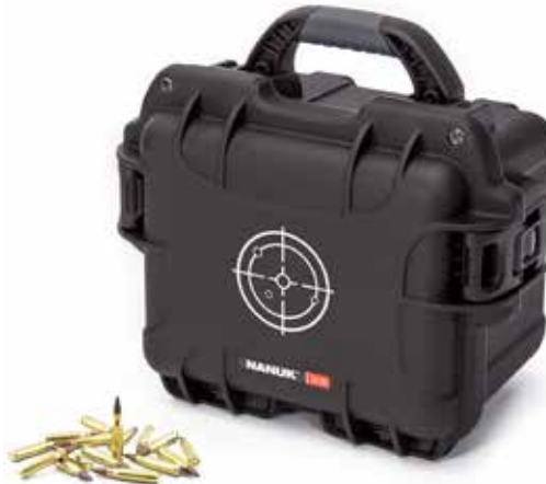
908 Waterproof Ammo Case

Exterior dimensions L12.5" × W10.1" × H6.0" L318mm × W257mm × H152mm