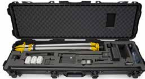
995 For DJI™ Ground Station RTK

Interior dimensions L24.0" × W24.0" × H14.2" L610mm × W610mm × H361mm Exterior dimensions L27.5" × W27.2" × H16.0" L699mm × W691mm × H406mm