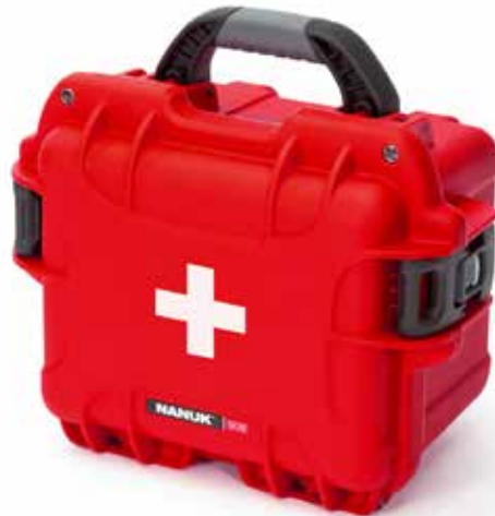
908 First Aid Cases

Exterior dimensions L12.5" × W10.1" × H6.0" L318mm × W257mm × H152mm