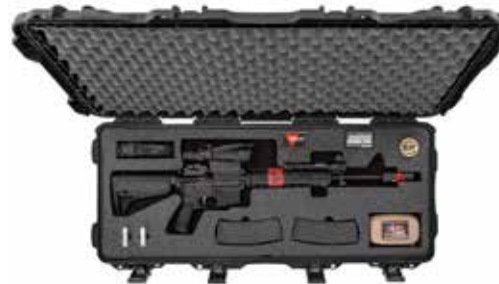
985 AR15 Case

Exterior dimensions L25.0" × W24.7" × H13.6" L635mm × W627mm × H345mm