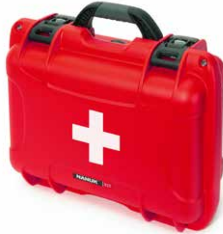
915 First Aid Cases

Interior dimensions L13.8" × W9.3" × H6.2" L351mm × W236mm × H157mm