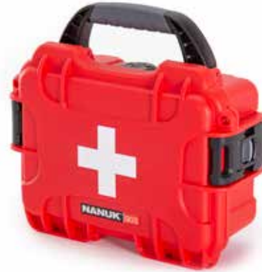
903 First Aid Cases

Interior dimensions L7.4" × W4.9" × H3.1" L188mm × W124mm × H79mm