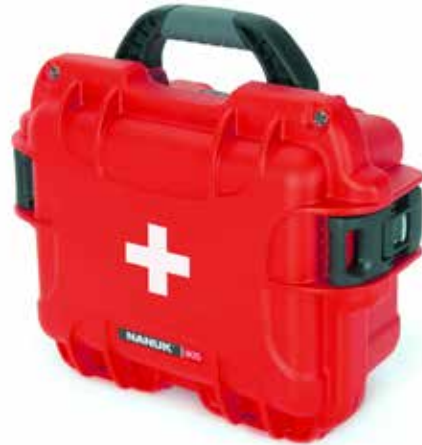
905 First Aid Cases

Interior dimensions L9.4" × W7.4" × H5.5" L239mm × W188mm × H140mm