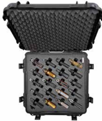
968 20UP Pistol Case