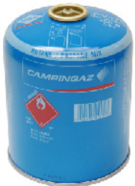
PROPANE/BUTANE Camping GAZ® CV-270 / CV-270 Plus CV-470 / CV-470 Plus