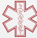
First Aid Supplies