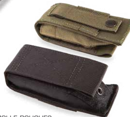
OPTIONAL MOLLE POUCHES