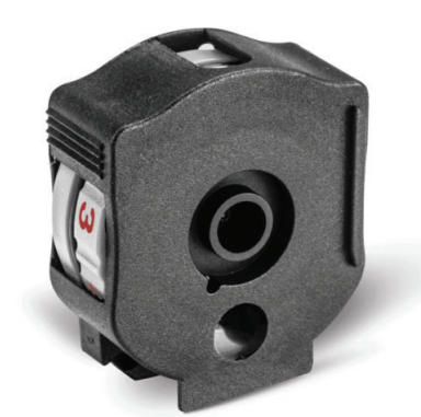
SWARM FUSION 10X GEN2