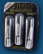
DEADMEAT BMP PAGE 9