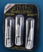
DEADMEAT BMP PAGE 9