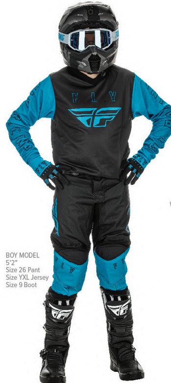
BOY MODEL 5'2" Size 26 Pant Size YXL Jersey Size 9 Boot