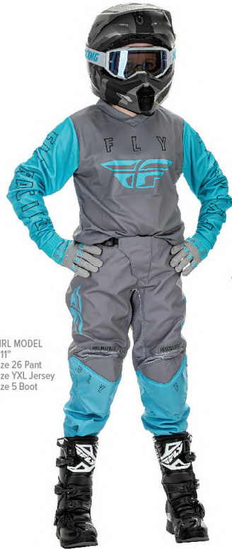
GIRL MODEL 4'11" Size 26 Pant Size YXL Jersey Size 5 Boot