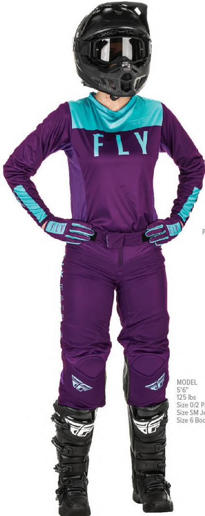
MODEL 5'6" 125 lbs Size 0/2 Pant Size SM Jersey Size 6 Boot

*Cross reference to men's size is approximate fit in comparison. Women's pants are shaped different than men's to fit the female body, so there are fitment differences between men's and women's