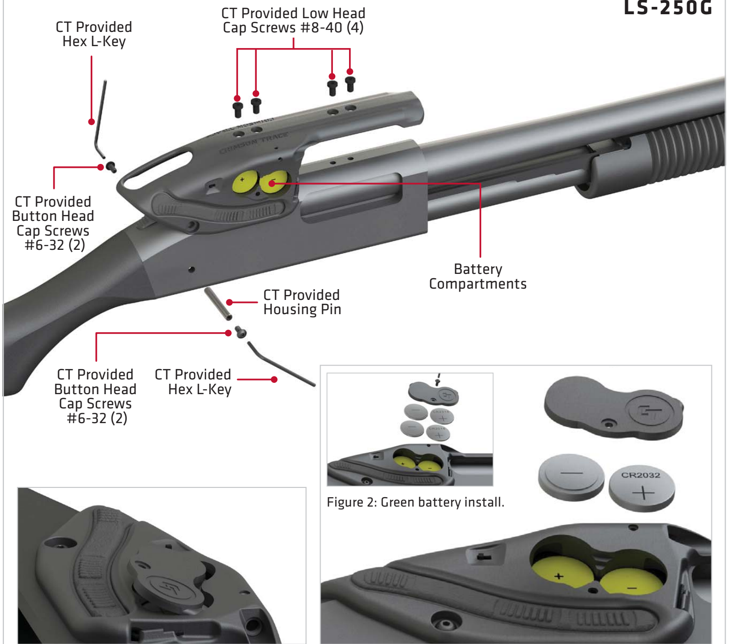
Figure 3: Battery cover placement.